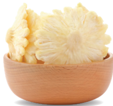
DRIED PINEAPPLE LESS SUGAR