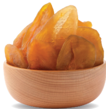
DRIED PASSION FRUIT WHOLE SLICE