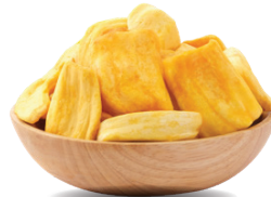
CRISPY JACKFRUIT CHIPS