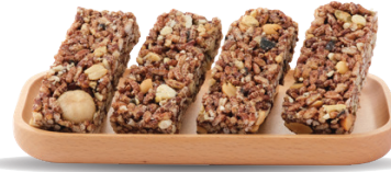
BROWN RICE BAR WITH SEAWEED AND NUTS