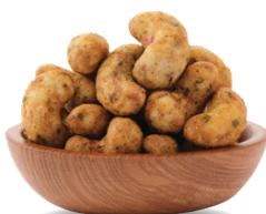
TOMYUM CASHEW NUT