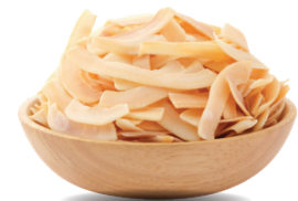
CRISPY COCONUT CHIPS