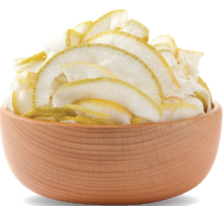
DRIED POMELO PEEL