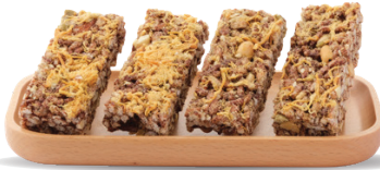
BROWN RICE BAR WITH FISH FLOSS