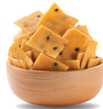
DRIED PASSION FRUIT SNACK