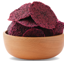
DRIED DRAGON FRUIT SUGAR-FREE