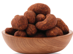
CINNAMON CASHEW NUT