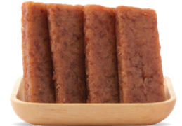
DRIED PASSION FRUIT BAR