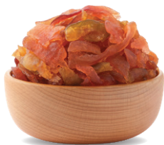
DRIED PASSION FRUIT STRIPS