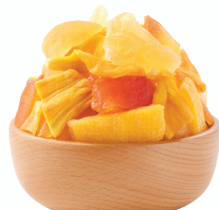
"MIX" SOFT DRIED FRUITS