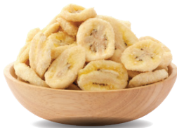
CRISPY BANANA CHIPS