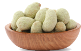
WASABI CASHEW NUT