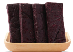
DRIED DRAGON FRUIT BAR