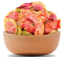
DRIED SPICY GUAVA