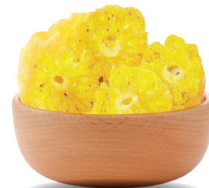
DRIED SPICY PINEAPPLE