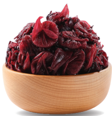
DRIED RED ROSELLE