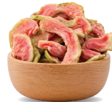
DRIED PINK GUAVA