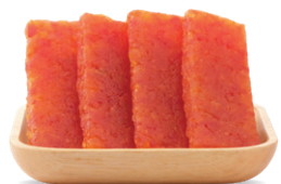
DRIED PAPAYA BAR