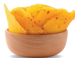
DRIED SPICY MANGO