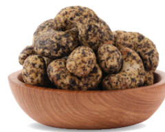
SEAWEED CASHEW NUT