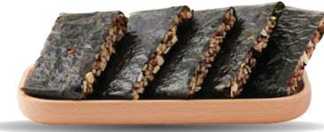
CRISPY SEAWEED SANDWICH