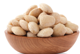
SACHA INCHI NUTS