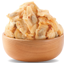
DRIED SPICY SOURSOP