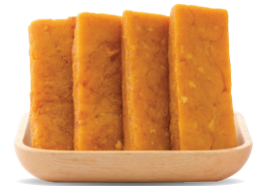
DRIED MANGO BAR