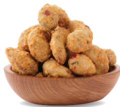
CHILI GARLIC CASHEW NUT