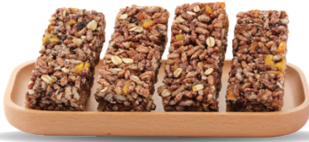
BROWN RICE BAR WITH FRUITS