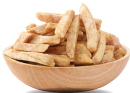
CRISPY TARO CHIPS