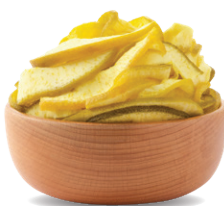
DRIED POMELO PEEL WITH PASSION FRUIT