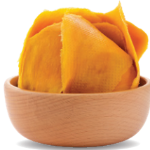
DRIED MANGO SUGAR-FREE