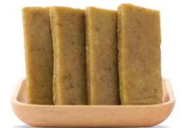
DRIED GUAVA BAR