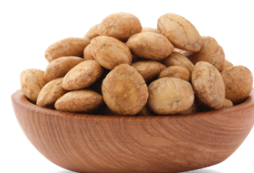
DRIED SACHA INCHI NUTS