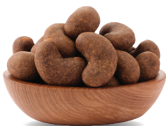
CHOCOLATE CASHEW NUT