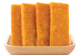
DRIED JACKFRUIT BAR